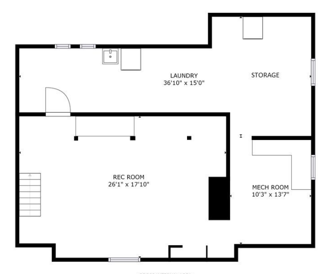
GROSS INTERNAL AREA FLOOR 1: 973 of, T. FLOOR 2: 1229 of, ft FLOOR 3: 465 of, T. EXCLUDED AREAS: REDUCED HEADSOOM BELOW 1.5M: 106 sq.ft TOTAL: 2963 os.ft SIZES AND DIMENSIONS ARE APPROXIMATE, ACTUAL MAY VARY