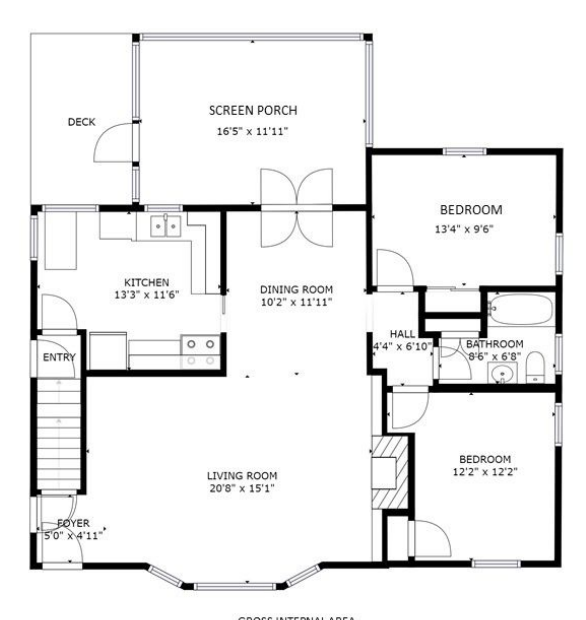
GROSS INTERNAL AREA FLOOR 1:997 Sq ft, FLOOR 2:1229 Sq ft FLOOR 3:465 Sq ft, EXCLUDED AREAS: REDUCED HEADROOM BELOW 15M: 106 Sq ft TOTAL 2:693 Sq ft SIZES AND DIMENSIONS ARE APPROXIMATE, ACTUAL MAY VARY