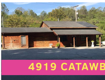
4919 CATAWBA RD: TRACT 2