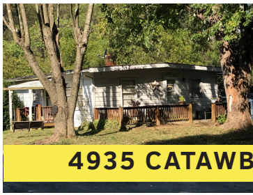
4935 CATAWBA RD: TRACT 1