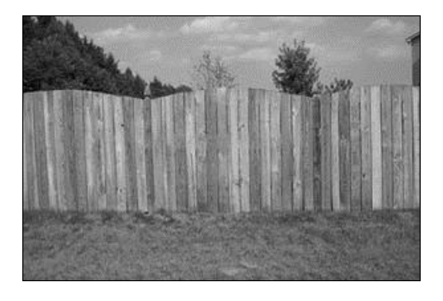
Figure A1-5: Six foot privacy fence with an arched (convex) top.