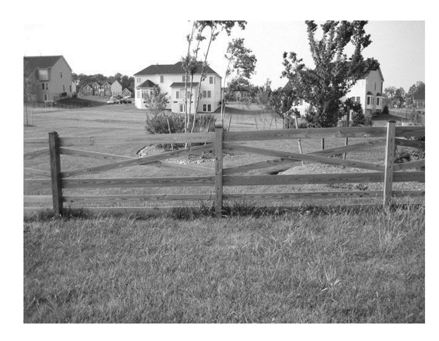
Figure A1-4: A four-foot padoock fence.