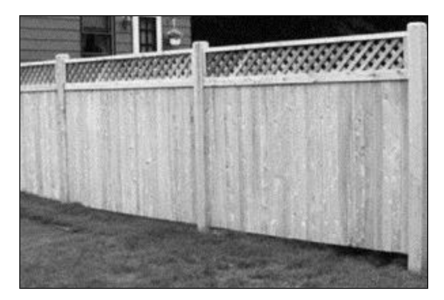
Figure A1-6: Six foot privacy fence, vertical board with one foot of lattice.

This neighborhood allows the same black aluminum and wrought iron fences as Quail Pond Estates. In addition, this neighborhood allows a six foot vertical board fence (privacy or board on board) with one foot of lattice. The allowed wooden fences are illustrated below: