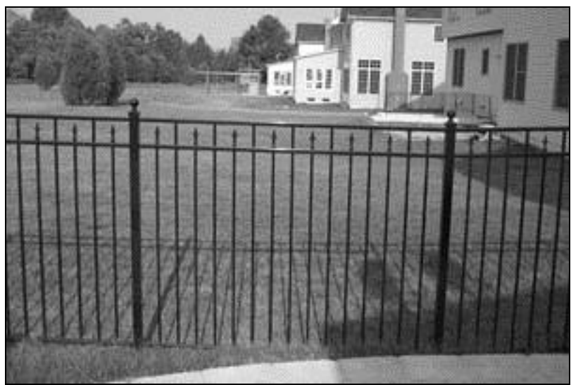
Figure A1-2: 5-foot black aluminum fence, with spikes and a floating safety bar across the top.

Figure A1-1: Four foot black aluminum fence with spikes on top.