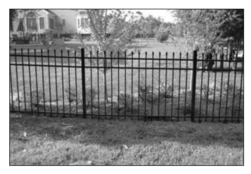
Figure A1-1: Four foot black aluminum fence with spikes on top.

Only black aluminum and wrought iron fences are allowed in Quail Pond Estates. Allowed fence heights are 4 feet and 5 feet. Numerous variations on the top portion of the fence exist in the Community. Some common variations include: spikes, spikes with a safety bar attached to the top of the spikes, spikes with a safety bar an inch above the spikes, scalloped (concave) spikes, arched (convex) spikes, balls instead of spikes, etc.