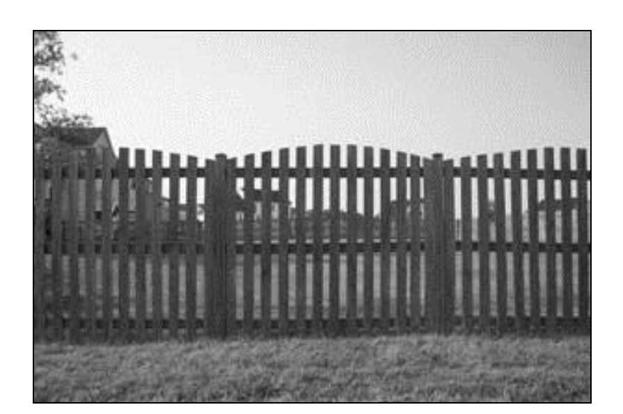
Figure A1-3: Four foot picket fence with arched (convex) top.

These two neighborhoods allow the same black aluminum and wrought iron fences as Quail Pond Estates. In addition, these neighborhoods also allow a four-foot wooden fence and a six-foot wooden privacy fence. The allowed wooden fences are illustrated below: