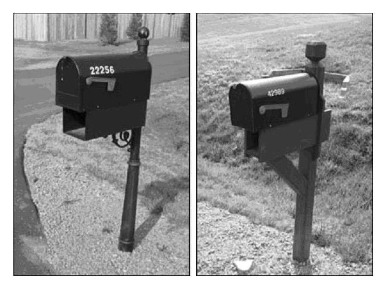
Figure 5-1a: Type A Mailbox-Model MP-200