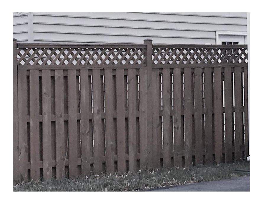
Figure A1-7: Six foot board on board fence, vertical board with one foot of lattice.

Figure A1-6: Six foot privacy fence, vertical board with one foot of lattice.