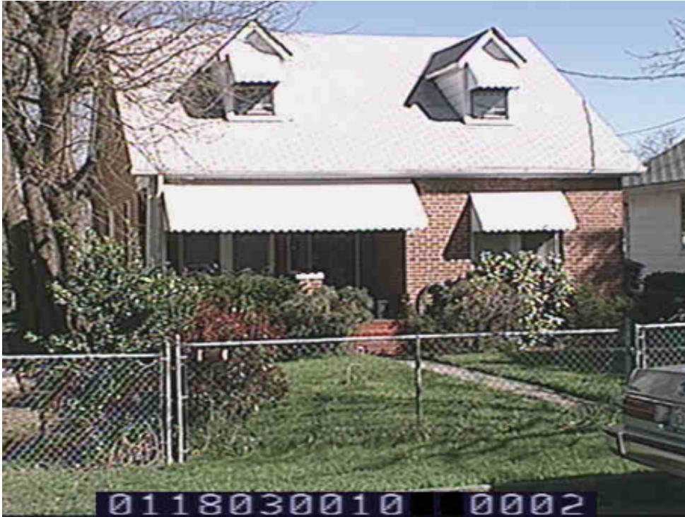
Last Photo Update 03/16/1997