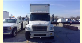
Extra photo 4