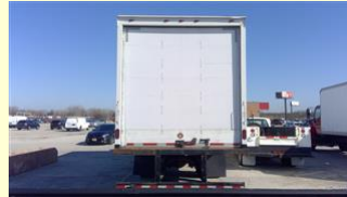
Extra photo 3