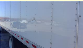
L box side gouged