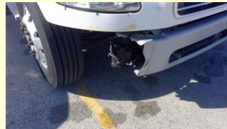
Front bumper collision dmg