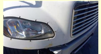
Hood collision dmg