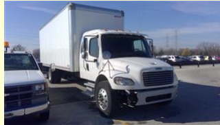
Extra photo 2