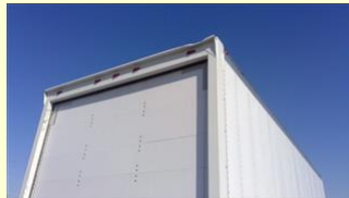
Extra photo 6