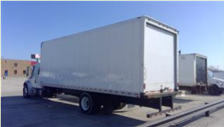
Extra photo 1