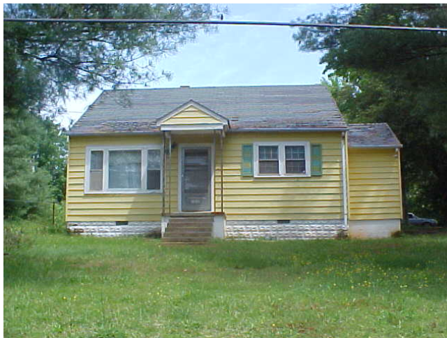
Main Structure Photo