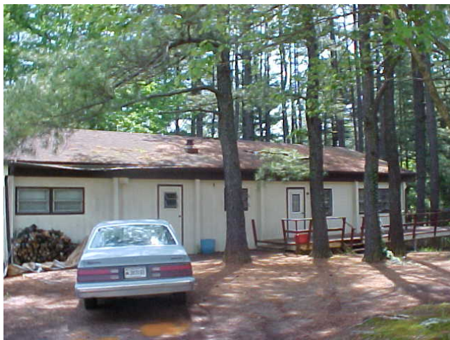
Main Structure Photo