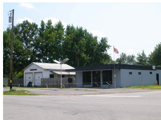
Last Photo Update 07/29/2014