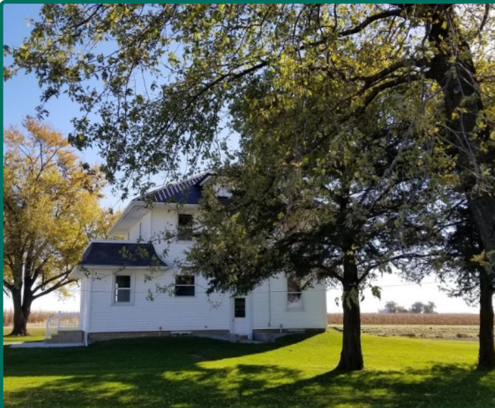
Back View of Home