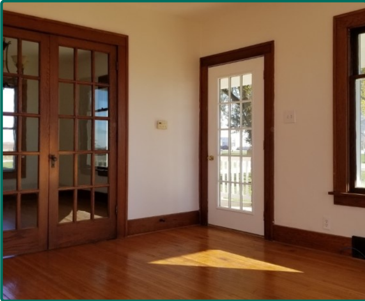
Main Level Living Room