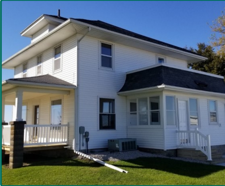
Open Front Porch