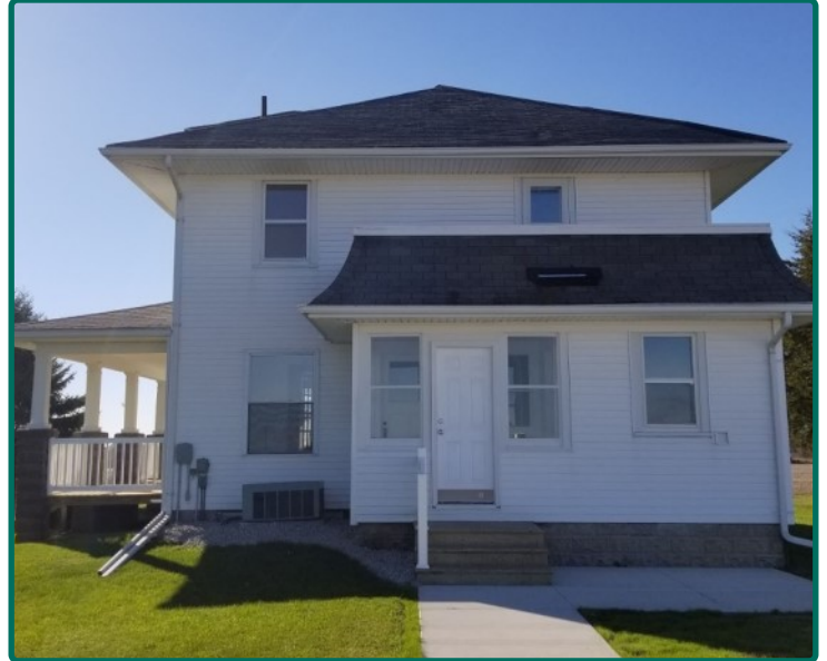
Side View of Home