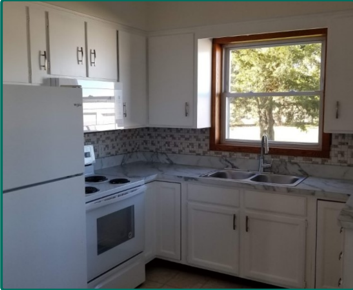
Main Level Kitchen