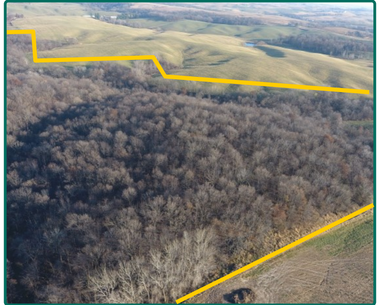
Northwest corner looking southeast