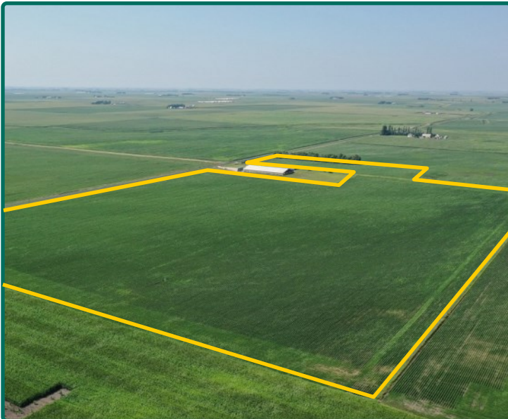
Southeast Looking Northwest