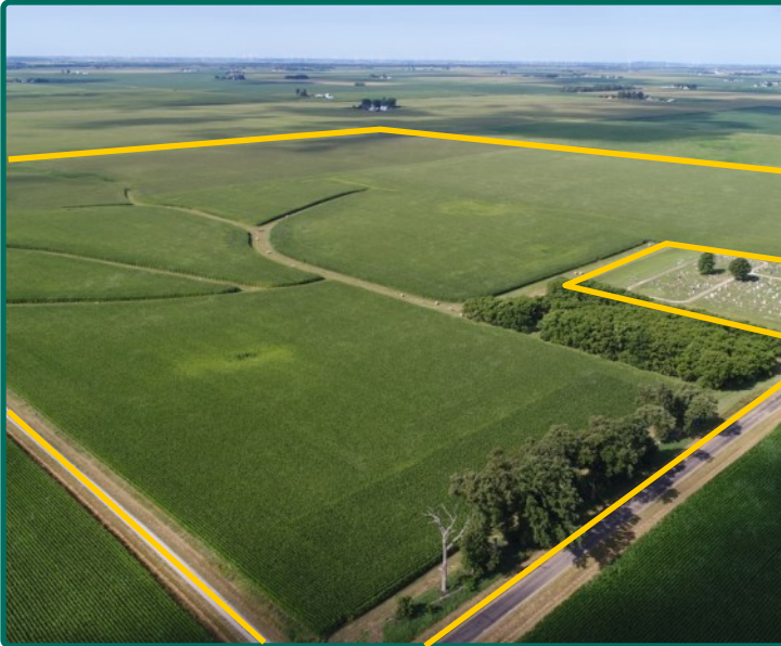
Section 7 - Northeast corner