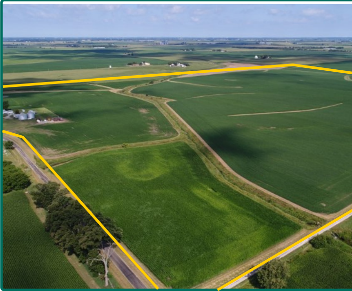
Section 6 - Southeast corner