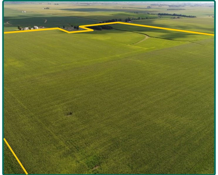
Section 7 - Southwest corner