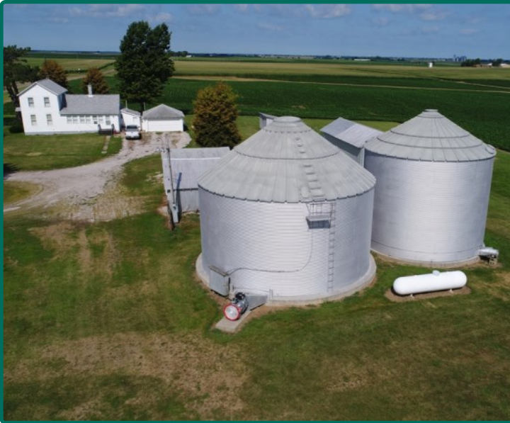
Section 6 - Building site