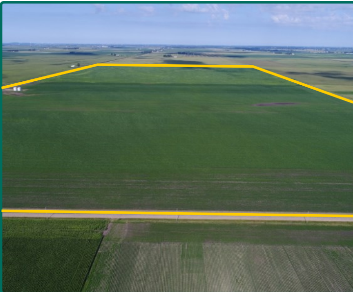
Section 8 - East side