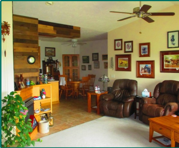
Kitchen/Living/Dining Room Area