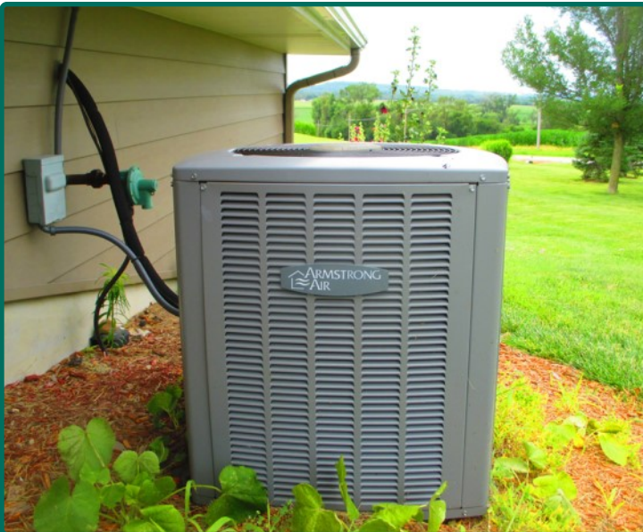
Armstrong Air Unit