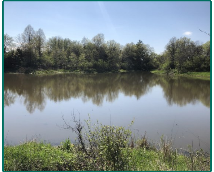
One of Four Ponds