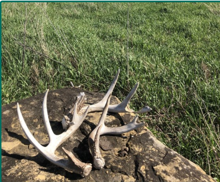
Shed Found in Spring 2019