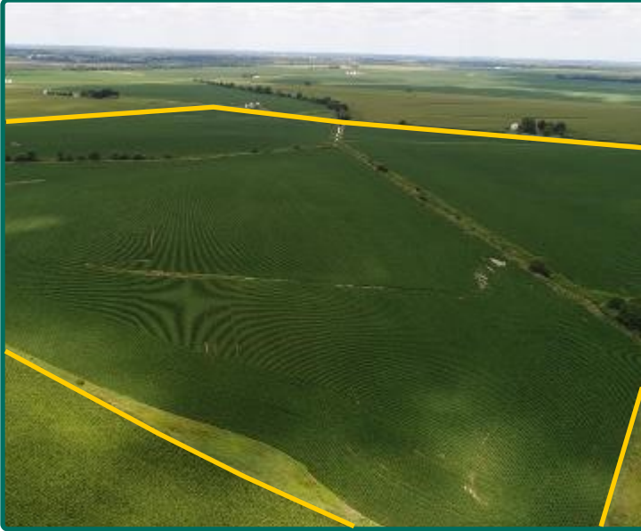
North 160 ac. - SE Corner looking NW