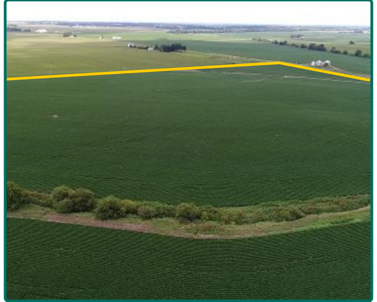
North 160 ac. - Looking NW