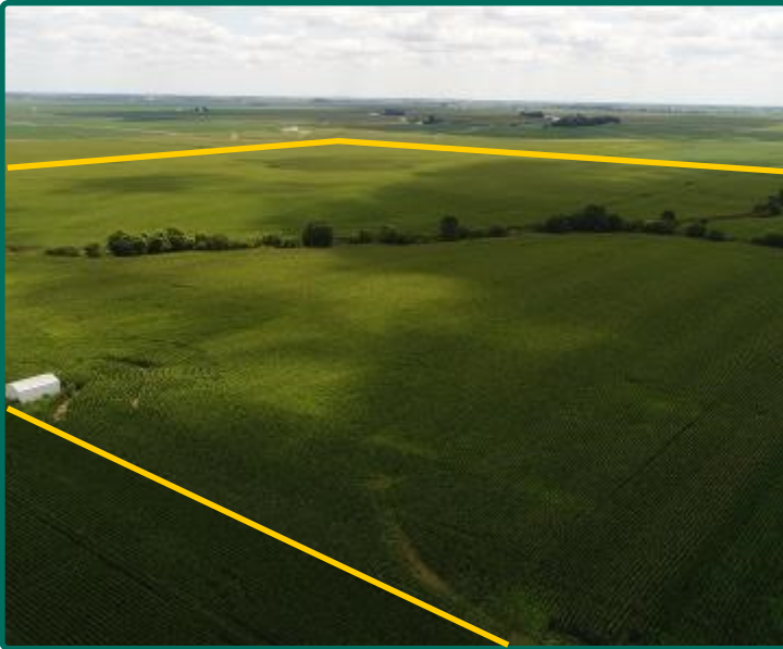
South 160 ac. - NW Corner Looking SE