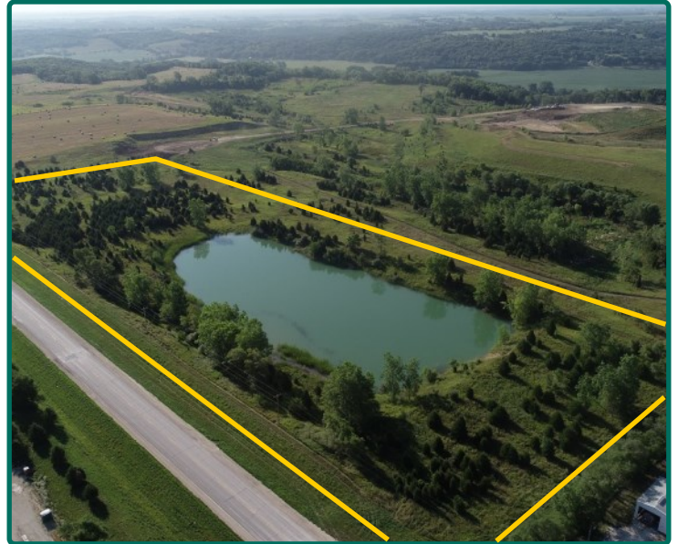
Northwest Looking Southeast