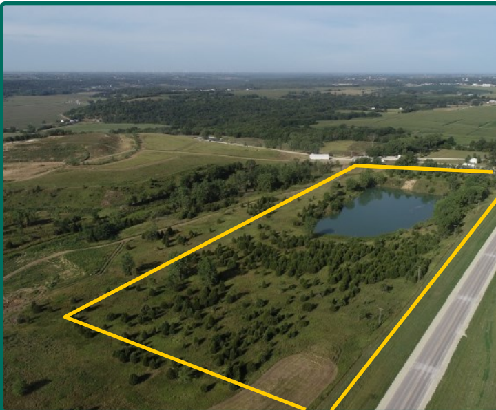
Northeast Looking Southwest