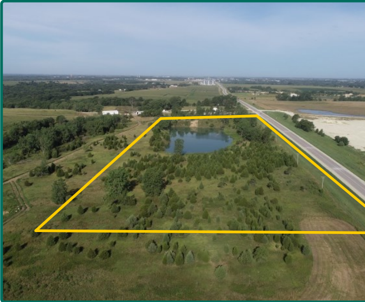
East Looking West