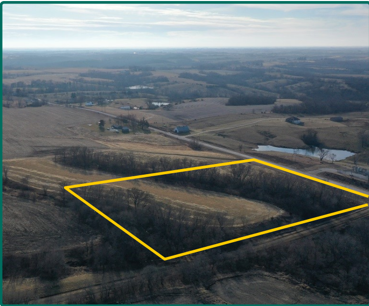
Northeast Looking Southwest