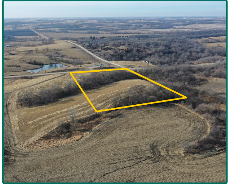
Southeast Looking Northwest