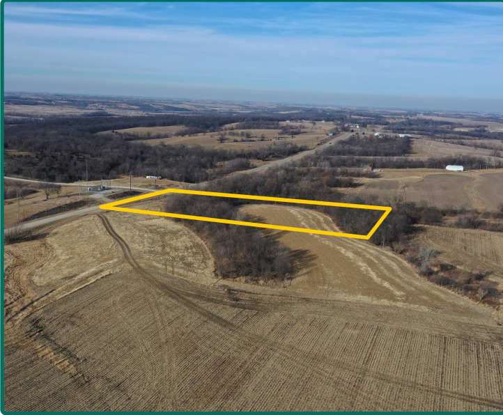
South Looking North