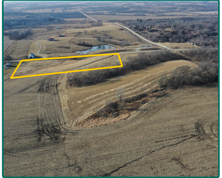
Southeast Looking Northwest