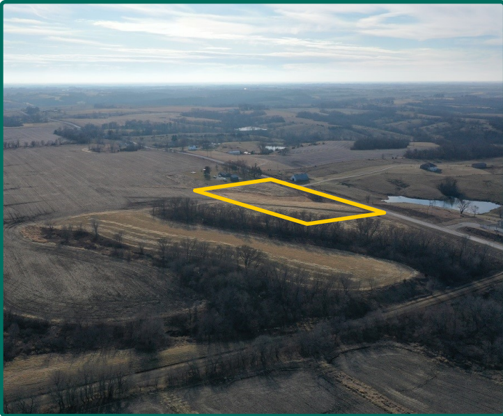
Northeast Looking Southwest