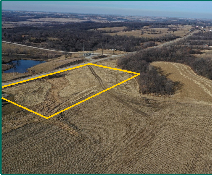
South Looking North