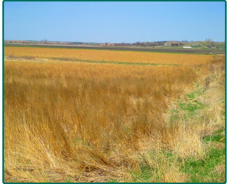
Well - NE Corner of the Southern Tract