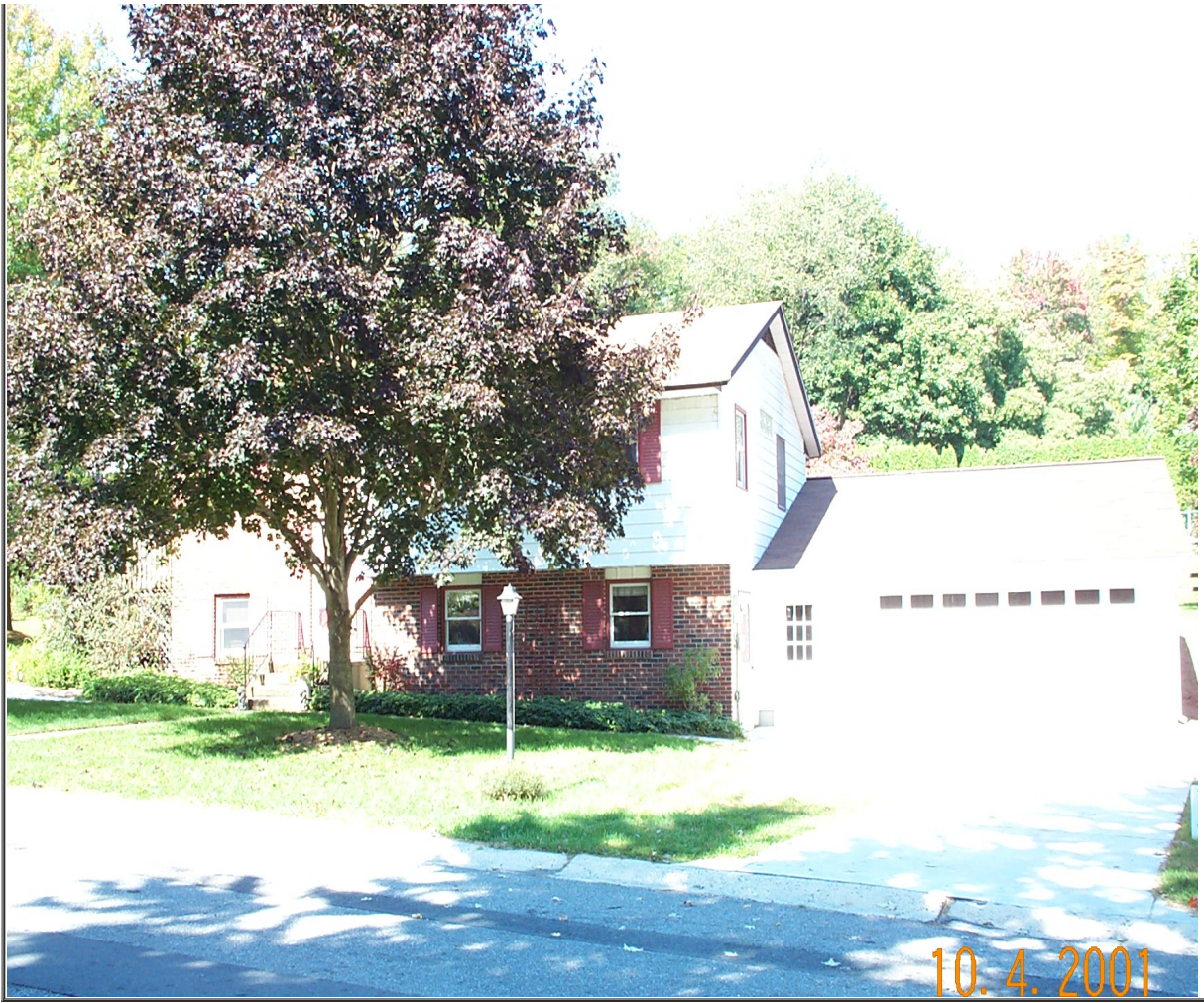
Schuylkill County Assessment Bureau CAMA Card