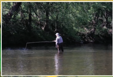
1,700'± Frontage on the Musconetcong