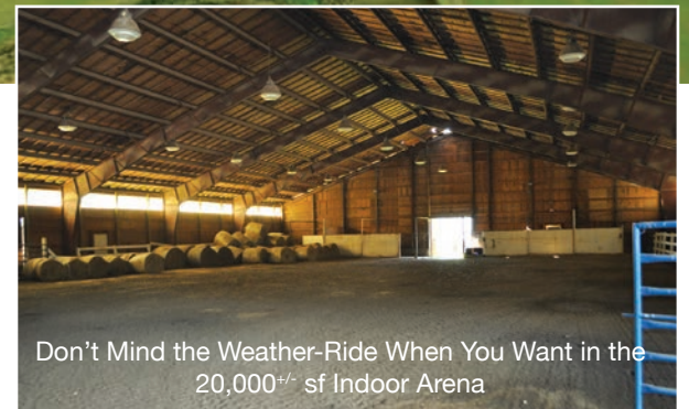
Don't Mind the Weather-Ride When You Want in the 20,000 +/- sf Indoor Arena