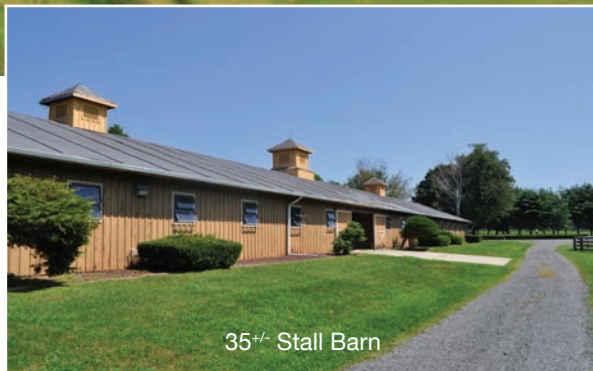
35 +/- Stall Barn