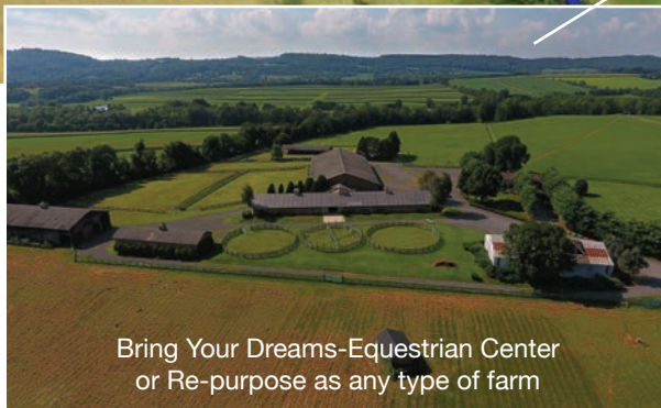
Bring Your Dreams-Equestrian Center or Re-purpose as any type of farm