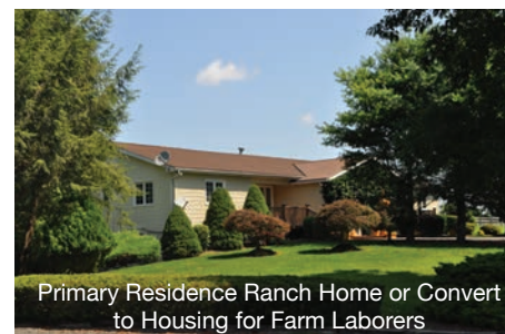
Primary Residence Ranch Home or Convert to Housing for Farm Laborers