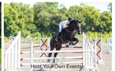
Host Your Own Events!