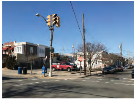
Commercial Site on Signalized Intersection