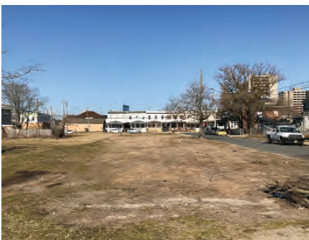
Ready to Build