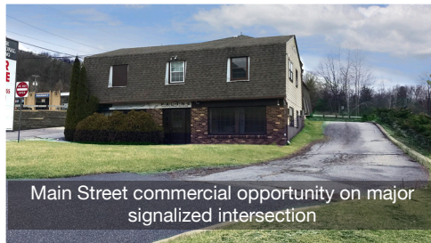
Main Street commercial opportunity on major signalized intersection

Bid On-Site or On-Line! Get the MaxSpann Smartphone App or go on-line