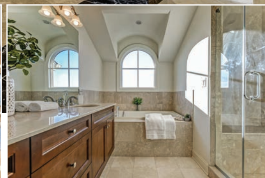
Finest finishing throughout the home