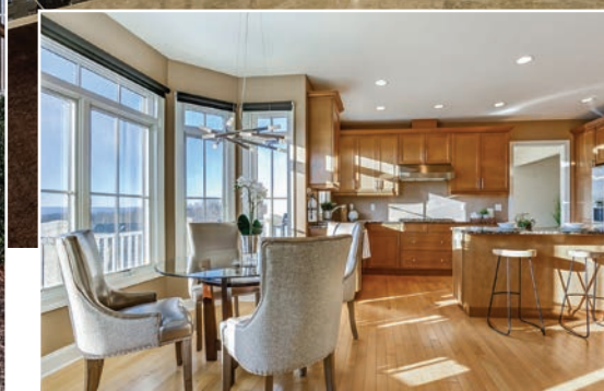
Sun drenched rooms