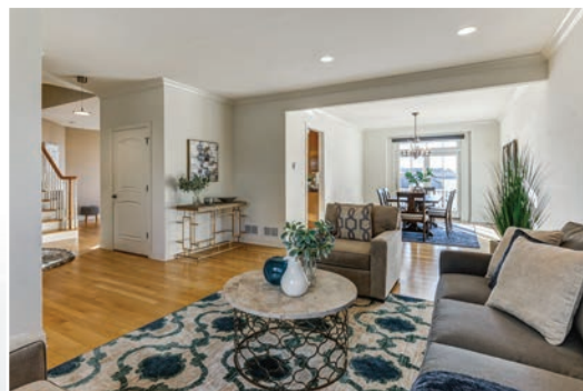
Open floor plans