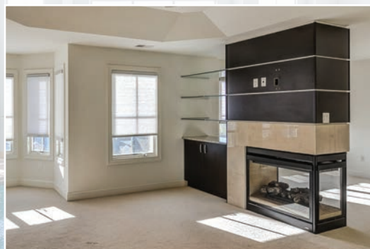
Luxury master suite with warming fireplace