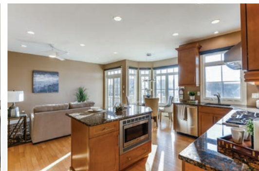
Perfect for parties