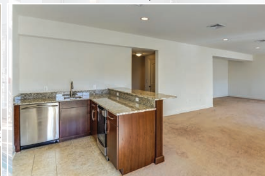
Finished walkout lower level

888-299-1438 MAXSPANN.COM SERVING THE NATION