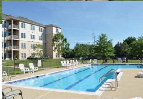
Finished Pool Open to the Residents