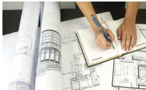
Pick up the Plans and Finish this Project!