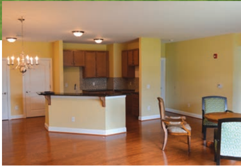
Sales Center Ready to Go!

Property Address: Fountainview Circle Newark, New Castle County, DE 19713