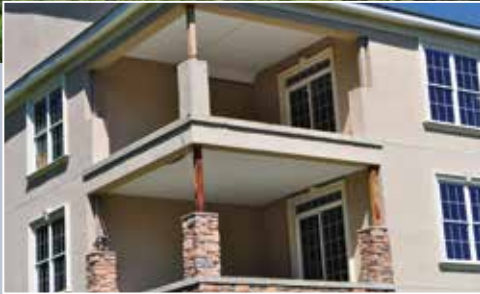
A Wonderful Opportunity to Complete this Project