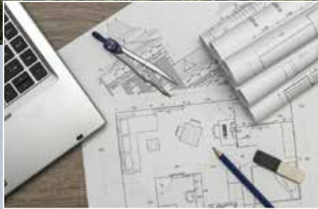
Make Plans for a Productive 2019!