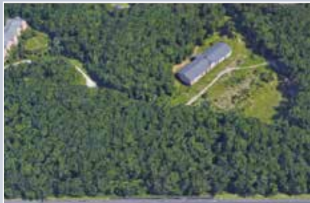
Potential for Additional Development

Address: Mount Hope Avenue & Constitution Boulevard Rockaway, NJ 07866