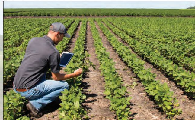
Choice Soils for Your Crops

Bid Live at the Auction or Online with Simulcast Bidding at maxspann.com