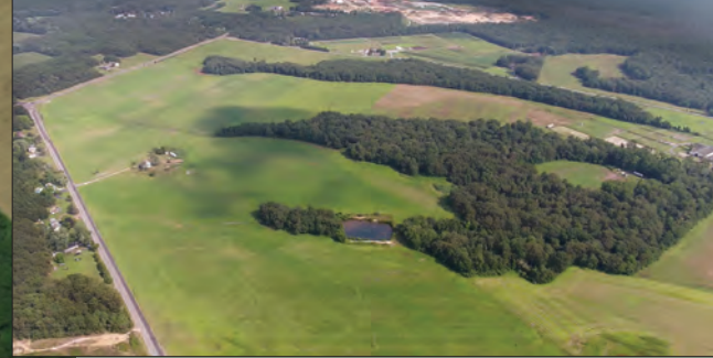
Farm 1 - Pond and Existing Home