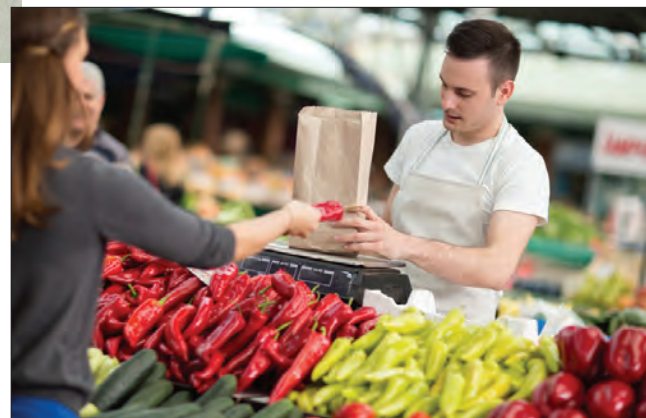
High Visibility Location for a Farm Stand

OFFICES: NEW YORK - NEW JERSEY - FLORIDA