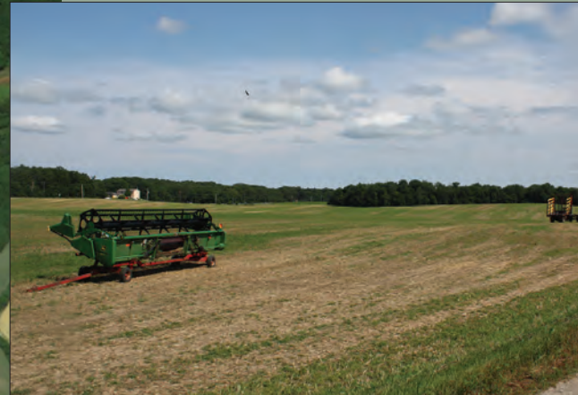
Farm 2 - Build Your Home and Farm Stand