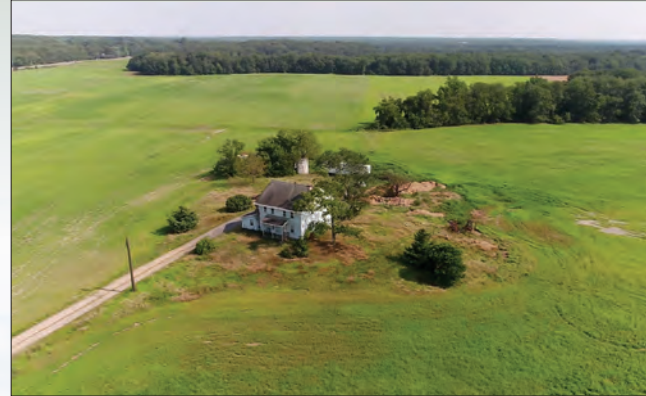
Ready to Renovate or Take Down and Build New!