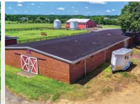
Property Address: 136 Five Points Rd, Colts Neck, Monmouth County, NJ 07722