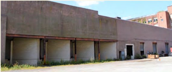
8 Loading Docs - 8 Access Doors