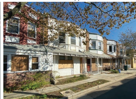
Ready For Renovation