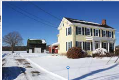
Commercial Building and Barns with Fantastic US Route 9 Frontage