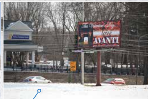
Billboard Rental Income