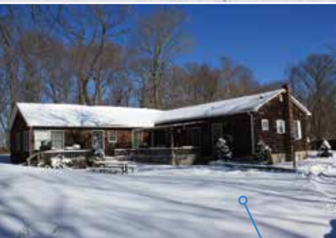
4 Bedroom Income Producer

135 ± Acres Farmland with Outstanding Frontage on US Route 9 Manalapan, Monmouth County NJ