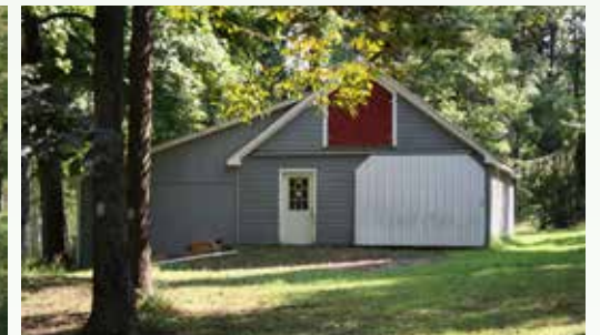
Barn for storage and processing your Maple Syrup