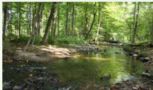
Frontage on Burnett Brook

2 MOUNT PAUL RD, MENDHAM TOWNSHIP MORRIS COUNTY, NJ 07945