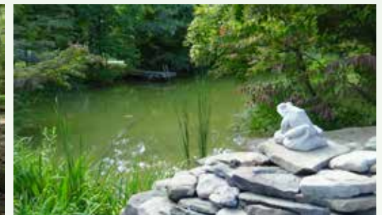
Enjoy your latest novel at the tranquil pond