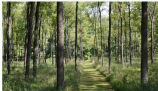
Walk your Sugarbush grove & Black Walnut plantation