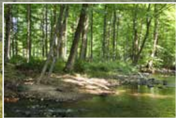
BURNETT BROOK AND NORTH BRANCH OF THE RARITAN RUN THROUGH THE PROPERTY

62.3+/- ACRE PRESERVED FARM IN THE HISTORIC ROXITICUS VALLEY