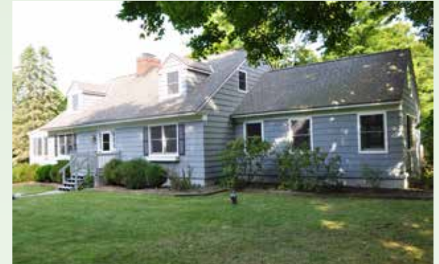
Existing Four Bedroom