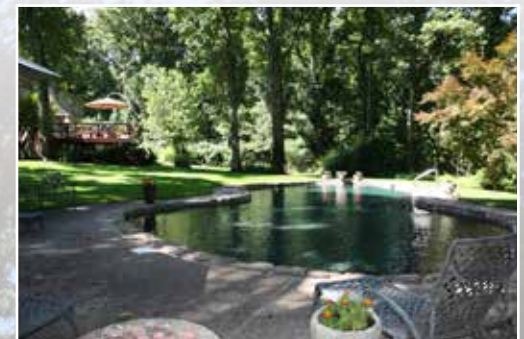
54' In-ground Gunite Pool