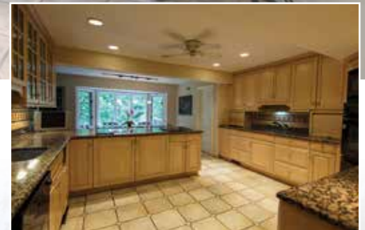
Sun drenched Gourmet Kitchen and breakfast nook with picturesque views of the grounds