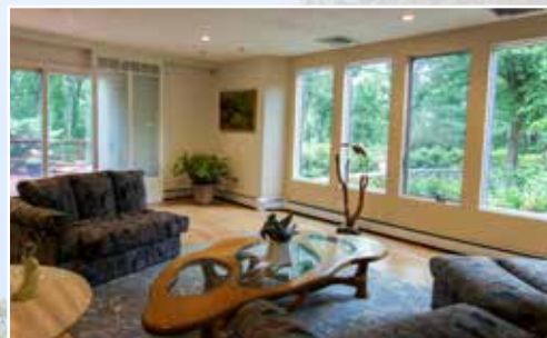
Spacious Living Room for formal and informal gatherings