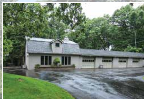
Carriage House with 2 bedroom, 2 bath, full kitchen and attached 10 car clear span garage