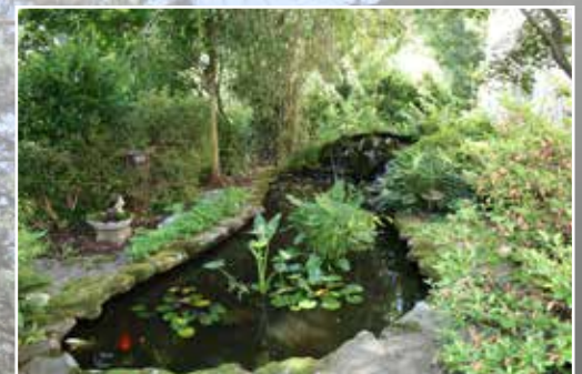
Tranquil Koi Pond