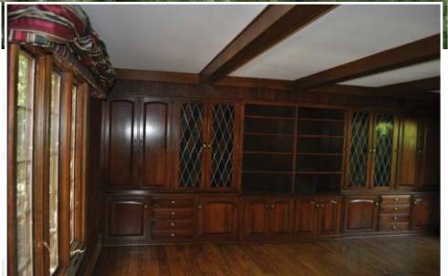
Private library with elegant cherry cabinets