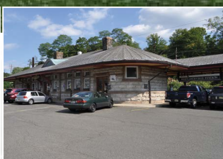
Direct Train to NYC or enjoy dining & shopping in downtown historic Bernardsville