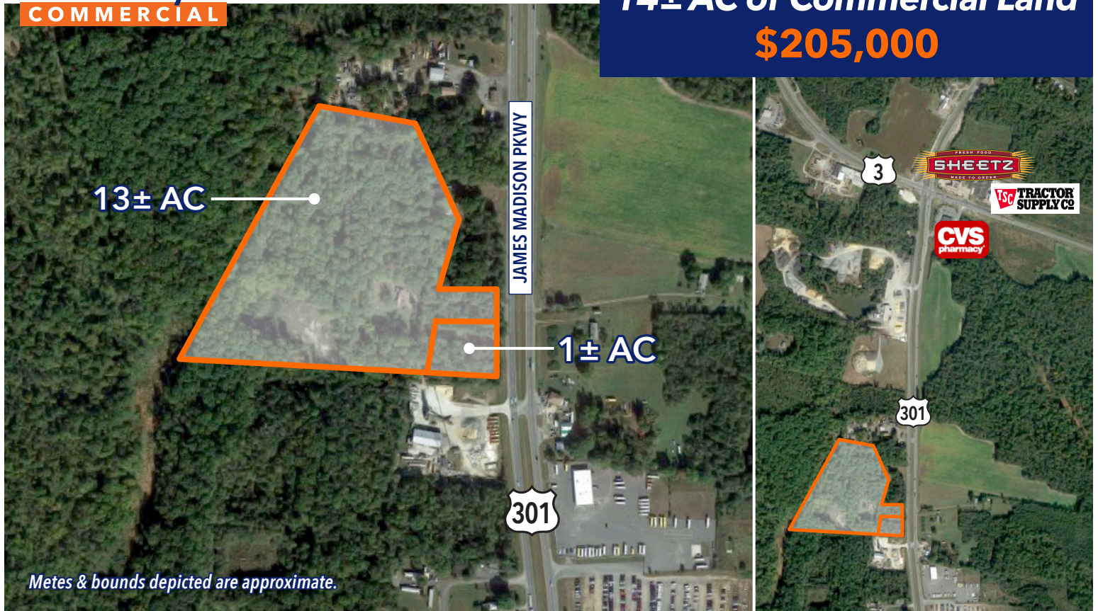
Metes & bounds depicted are approximate.