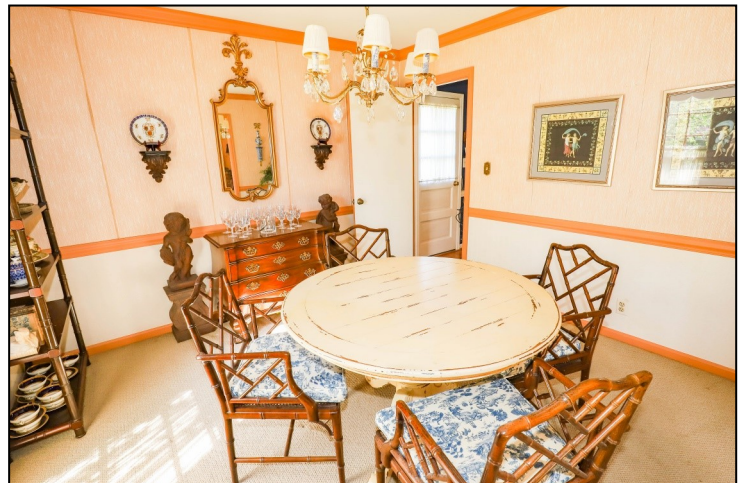
All room measurements shown are approximate and may have been rounded.