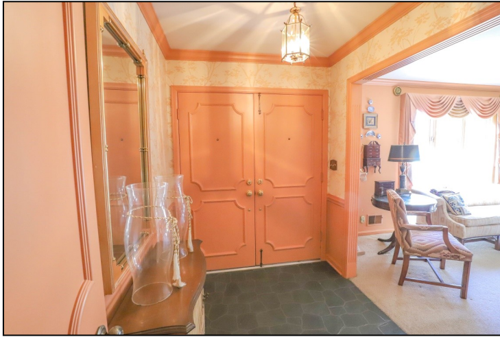
Front Foyer approx. 6' x 7'10". Brass light fixture, crown molding, black stone linoleum flooring, French front doors, double doorways into living room and the hallway.