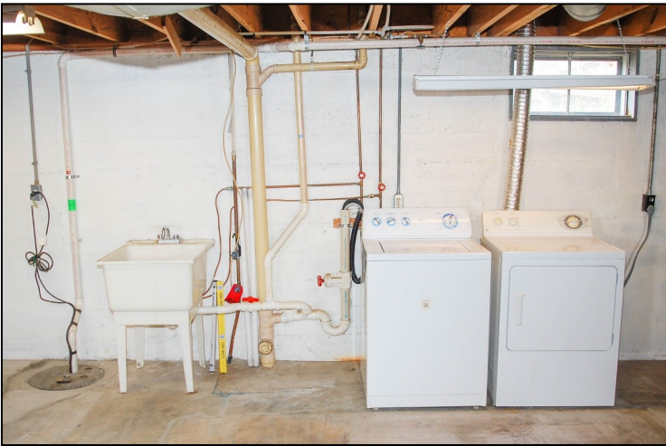
The full basement has approx. 1,874 total sq. ft. with approx. 1,020 finished sq. ft. and approx. 854 unfinished sq. ft.