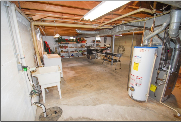
Basement Unfinished Area approx. 31'4" x 27'3" Amana washer, GE electric dryer, older Kenmore dryer, 3 storage drawer units with counter top all remain with the house.