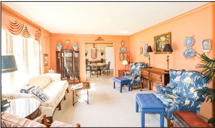
Living Room approx. 15'10" x 13'7", triple front windows, crown molding, carpeted, double doorway leading in from the front foyer, and double doorway into the formal dining room.