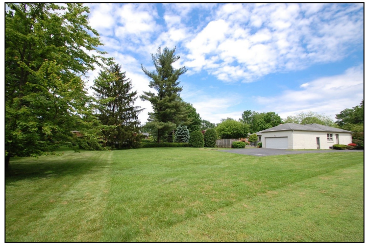
The open area behind the driveway is a part of the Douglas Hills Common Space.