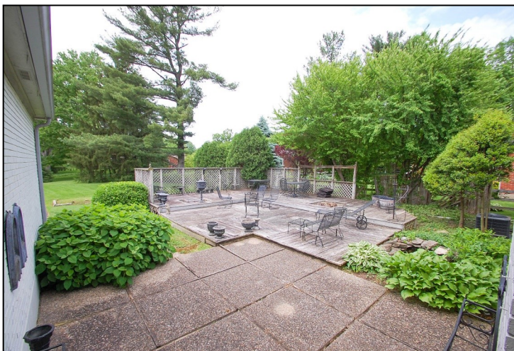
Concrete Patio is approx. 15' x 18". The wood deck needs replacement.