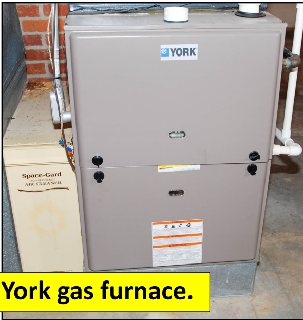
York gas furnace.