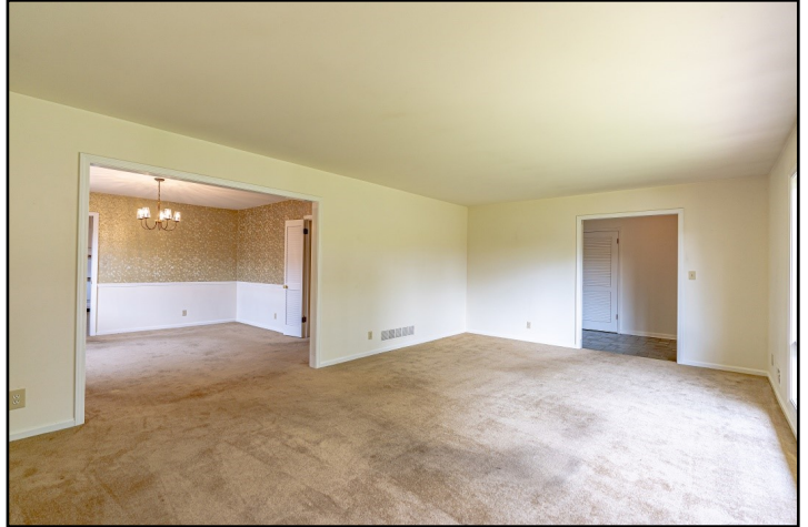
Living Room approx. 21’10” x 13’8”. Large triple front windows, double doorway leading in from the front foyer, and triple doorway into the formal dining room. Carpeted.