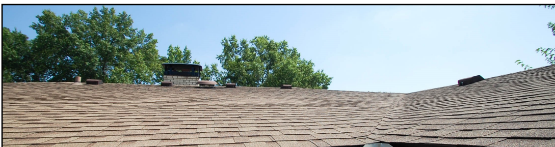
Roof looks good! We do not have any information on the exact age.