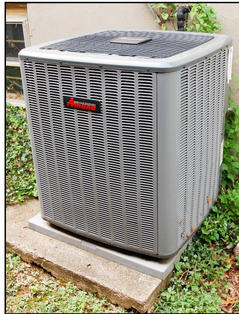
Amana Central Air Unit. There is a sticker on the furnace that indicates that the A/C unit and a new coil were installed on 8-16-16 by Tom Drexler Plumbing, Air & Electric.