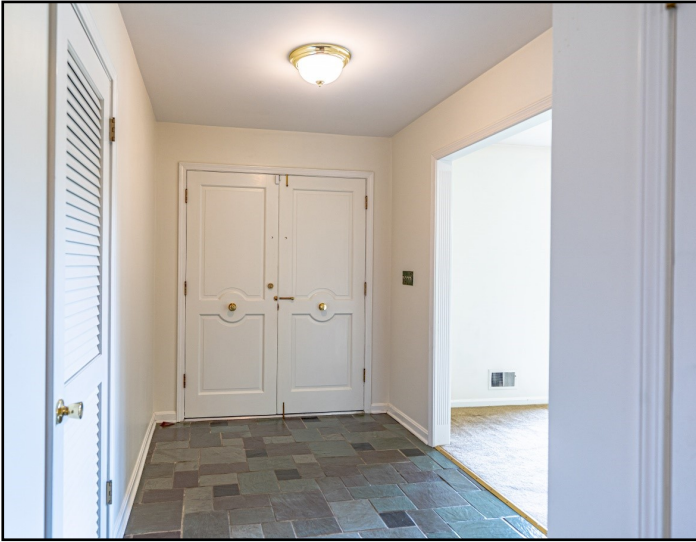
“L” Shaped Front Foyer approx. 6’ 8” x 13’9”. Front French doors. Two louvered door coat closets. Double doorway into living room, single doorway into den, and single doorway to hall. Stone flooring.