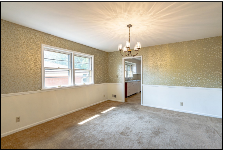
Formal Dining Room approx. 13’7” x 13’6”. Chair rail, double side windows, chandelier, triple doorway leading in from the living room, French louvered doors into the den, and a pocket door into the eat-in kitchen. Carpeted.

All room measurements shown are approximate and may have been rounded.