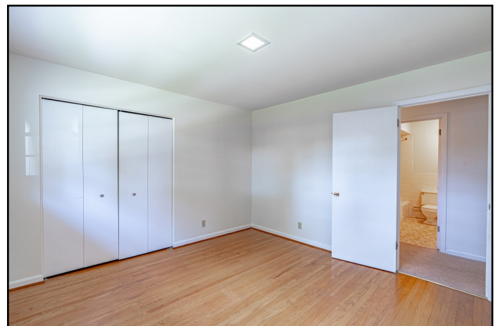
Front Middle Bedroom approx. 12'6" x 11'9", plus the double closet. Oak Hardwood Flooring. Double front windows.