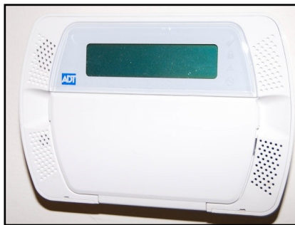
The house appears to be wired for an alarm system. It is not active at this time. The ADT control panel is located in the hall.