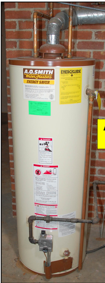
A.O. Smith 50 gallon, gas water heater.