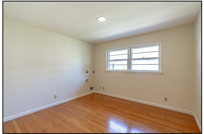
Middle Side Bedroom approx. 11'4" x 11'9", plus the large double closet. Oak Hardwood Flooring. Large double closet, double side windows, and washer & dryer hook-ups (the original washer and dryer hook-ups are still in the basement).