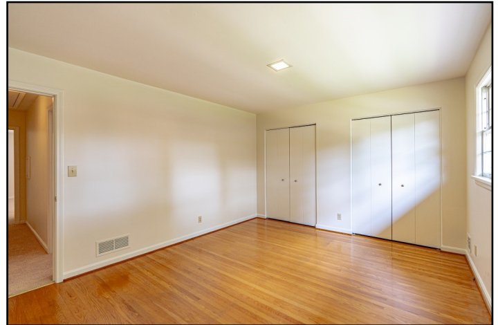
Front Corner Bedroom approx. 15'2" x 11'9", plus the 2 double closets. Oak Hardwood Flooring. Double front windows.