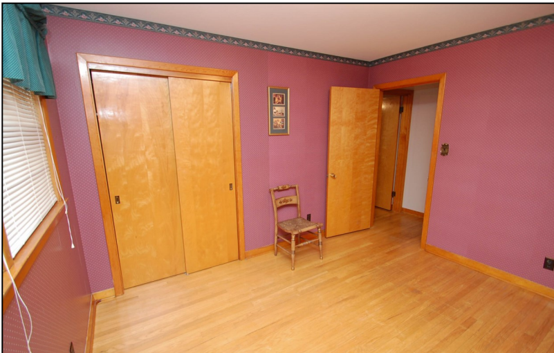
Middle Bedroom approx. 11'8" x 10'1" plus the double closet, oak hardwood flooring, natural finished woodwork, double side windows.