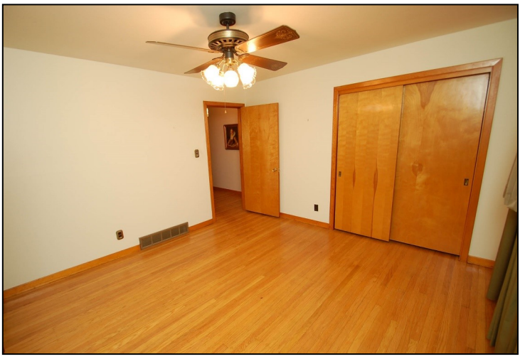
Front Corner Bedroom approx. 12'11" x 12'4" plus the double closet, oak hardwood flooring, natural finished woodwork, double front windows, single side window. Note: Floor does have 3 small cigarette burns.