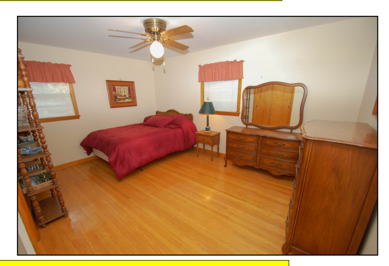
Rear Bedroom approx. 15'6" x 11' plus the double closet, oak hardwood flooring, natural finished woodwork, single rear and side windows.

All room measurements shown are approximate and may have been rounded.