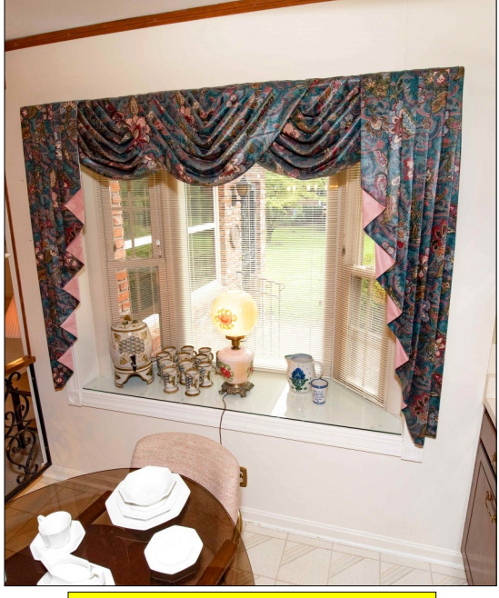
A 5'7" bay window overlooking the rear patio.