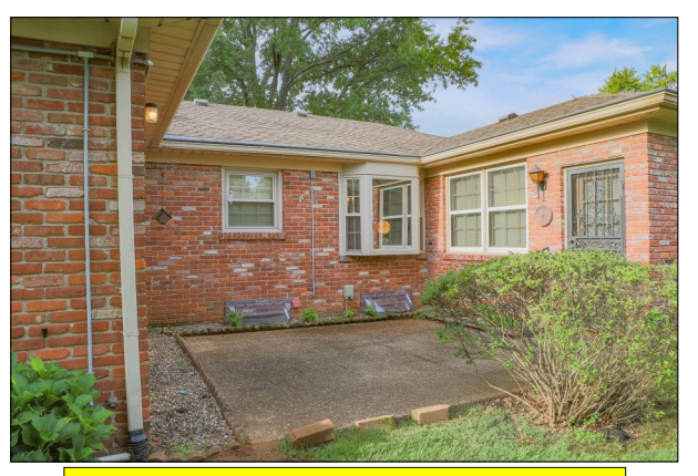
Rear Patio is approx. 13'6" x 12'5".