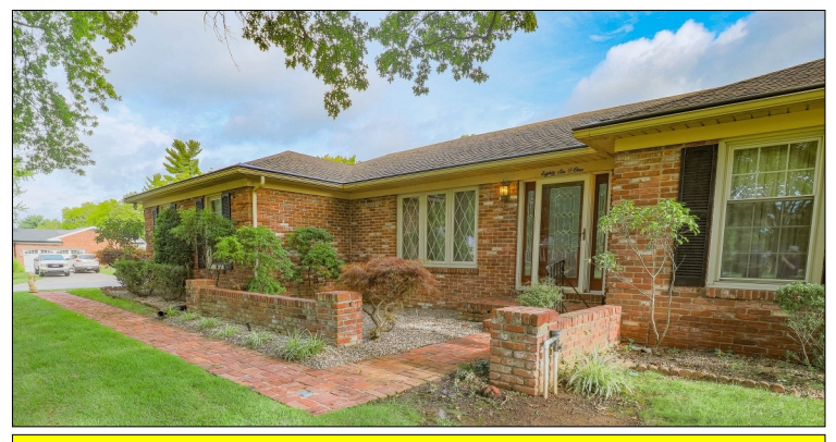
Home has two brick walkways and a front courtyard.