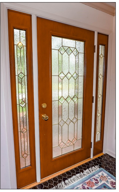
The beautiful replacement front door is from The Door Store's Amherest collection with a beautiful blending of classic diamond shaped beveled clear glass, frosted glass, and clear water glass, all with brass caming. Plus, two matching side lights and a Pella full view storm door.

Front Foyer approx. 7'2" x 9', crown molding with picture frame molded and scalloped wainscoting accented by a beautiful light fixture and the ceramic tile floor. Three double doorways with fluted casing leading into the living room, dining room, and the main hallway.