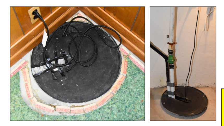
B-Dry System was installed on 19' of the far front wall in the finished area including a front corner sump pump on 9/12/91. The house does have second sump pump in the unfinished area.