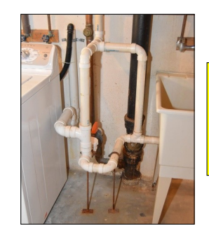
Through an MSD program, a sewer backflow prevention valve was installed in 1997.

According to the family, approximately two years ago there was a basement leak in the finished area under the side window which did damage some of the carpet. The window and window well were repaired and there has not been any signs of leaking since. Even though only a relatively small area of the carpet was damaged, the carpet was replaced in that section of the finished basement.